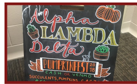
PumpkinFest 2018 (page 2)