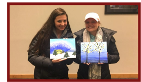
Semesterly Paint Night (page 3)