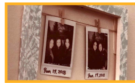
Dorm Design Night (page 2)