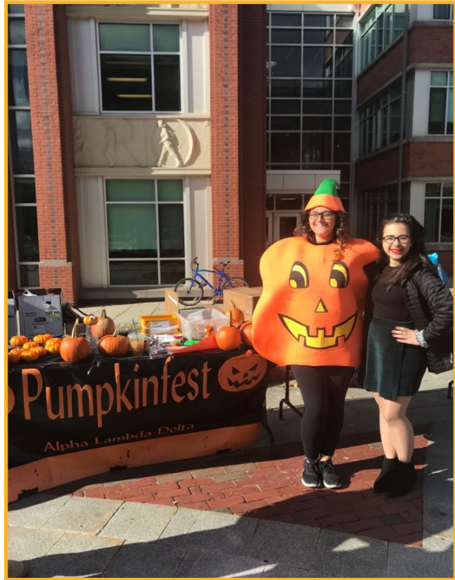
VOLUNTEERS POSE FOR A PHOTO IN FRONT OF THE PUMPKINFEST TABLE

E-Board and general members alike enjoyed the ALD tradition, which raised money for the American Cancer Society for the second semester in a row. As is always the case with ALD fundraisers, members made UConn proud as they volunteered their time toward a great cause.