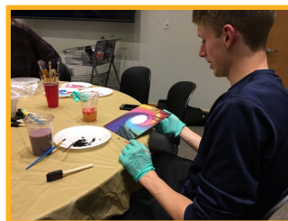
MEMBERS POSE WITH THEIR CREATIONS (TOP LEFT), WHILE OTHER MEMBERS WORK AWAY TO PERFECT THEIR MASTERPIECES WHILE SIPPING ON FRUITY MOCKTAILS