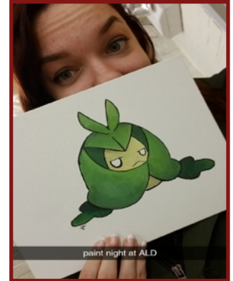
AN ALD MEMBER POSES WITH THEIR PAINT NIGHT CREATION

The Spring 2018 Paint Night was just what UConn students stressed out with midterms needed to unwind. Everyone gathered in Storrs Hall, where there were quality canvases, paints, brushes, and great company. Many ALD members and their friends came to express their creativity in a way that they normally do not have time for. It was great to see people bouncing ideas off of each other as they worked. Some people decided to paint quotes, others painted animals, and someone even decided to paint an adorable Pokémon.