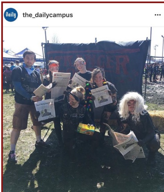
THE EGGSECUTIVES ARE PICTURED POSING WITH “STRANGER THINGS” PROPS FOR THE DAILY CAMPUS’ INSTAGRAM PAGE