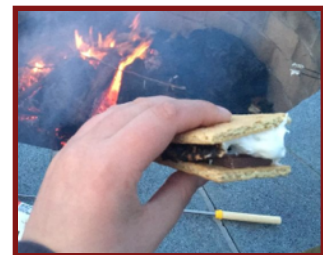
(RIGHT): S'MORES MAKING MATERIALS WERE PROVIDED FOR MEMBERS LOOKING TO SWEETEN UP THEIR BONFIRE EXPERIENCE