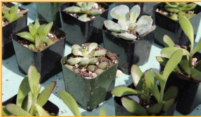
FLOWERFEST IS KNOWN FOR ITS SALE OF SUCCULENTS AND CACTI, POPULAR PLANT CHOICES AMONG COLLEGE STUDENTS. THIS YEAR, THE ALD EXECUTIVE BOARD PAINTED THE SPIRIT ROCK TO ADVERTISE THE FUNDRAISER

On Wednesday, April 11th, Alpha Lambda Delta held its annual FlowerFest on Fairfield Way on the University Seal. This year, the money we received was donated to the American Cancer Society. We sold cacti, succulents, and a variety of pots for decoration. Many people came to browse and chose the plants they like. ALD members volunteered to help sell plants to people and put their plants in the decorative pots.