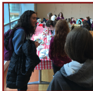
ALD MEMBERS LINE UP TO GET THEIR FREE DAIRY BAR ICE CREAM BEFORE SITTING DOWN WITH FELLOW MEMBERS TO SOCIALIZE AND ENJOY THEIR SWEET TREAT