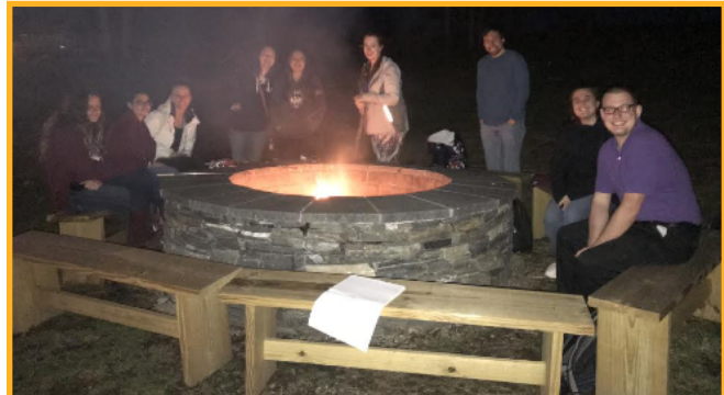
(ABOVE): ALD MEMBERS AND THE E-BOARD ENJOY THE BONFIRE

A night enjoyed by many, the bonfire will hopefully make a return in the semesters to come as a warm way to relieve stress during the crunch time before finals.