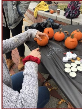
PASSERSBY COULD CHOOSE A PRE-CARVED PUMPKIN TO TAKE HOME, OR TAKE THE PLUNGE AND CARVE THEIR OWN

Decorating supplies ranged from ribbon to markers, to glitter and stickers. Once finished, students could even purchase tea lights so their pumpkin masterpiece could be lit from within. After the day of fall festivities, ALD raised a total of $150 for the Big Brothers Big Sisters non-profit, a youth mentoring program that aims to help children reach their potential.