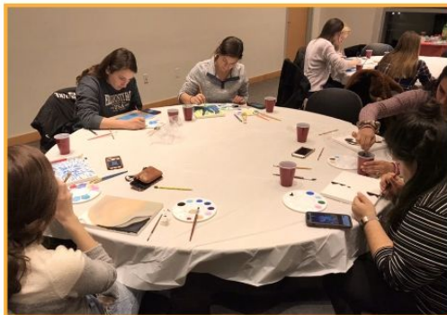
GENERAL MEMBERS HAVE A GREAT TIME SOCIALIZING AND SIPPING MOCKTAILS WHILE PAINTING THEIR OWN MASTERPIECES