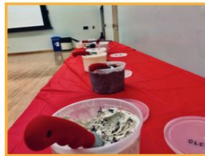
ALD PROVIDED MEMBERS WITH A SWEET WAY TO DE-STRESS BEFORE FINALS, FEATURING MULTIPLE DAIRY BAR ICE CREAM FLAVORS AND A VARIETY OF TOPPINGS

ALD. If you weren’t able to make it to this social, make sure to stop by the one in the spring semester!